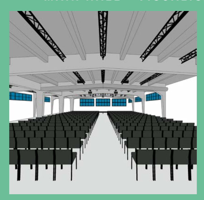
Seating ahead (view from Front Hall)