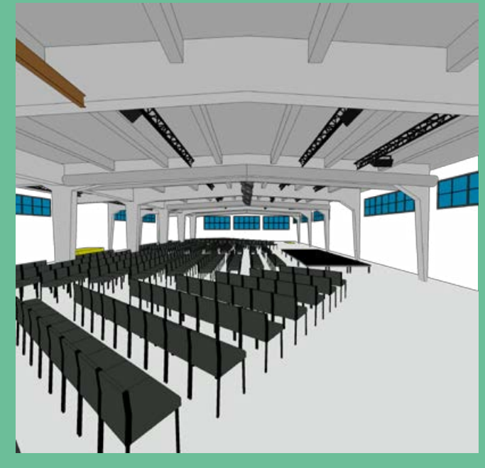
Seating side (view from Front Hall)